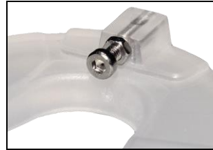
Fig. 4: Adjusting screw & locknut