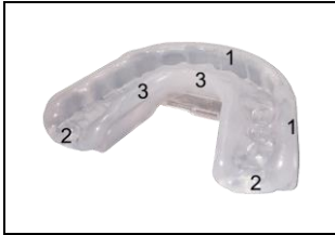
Fig. 2: Upper jaw tray