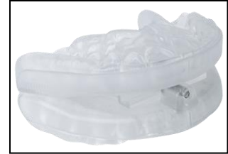
Fig. 5: Fitted SomnoGuard® AP 2