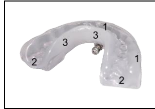
Fig. 3: Lower jaw tray